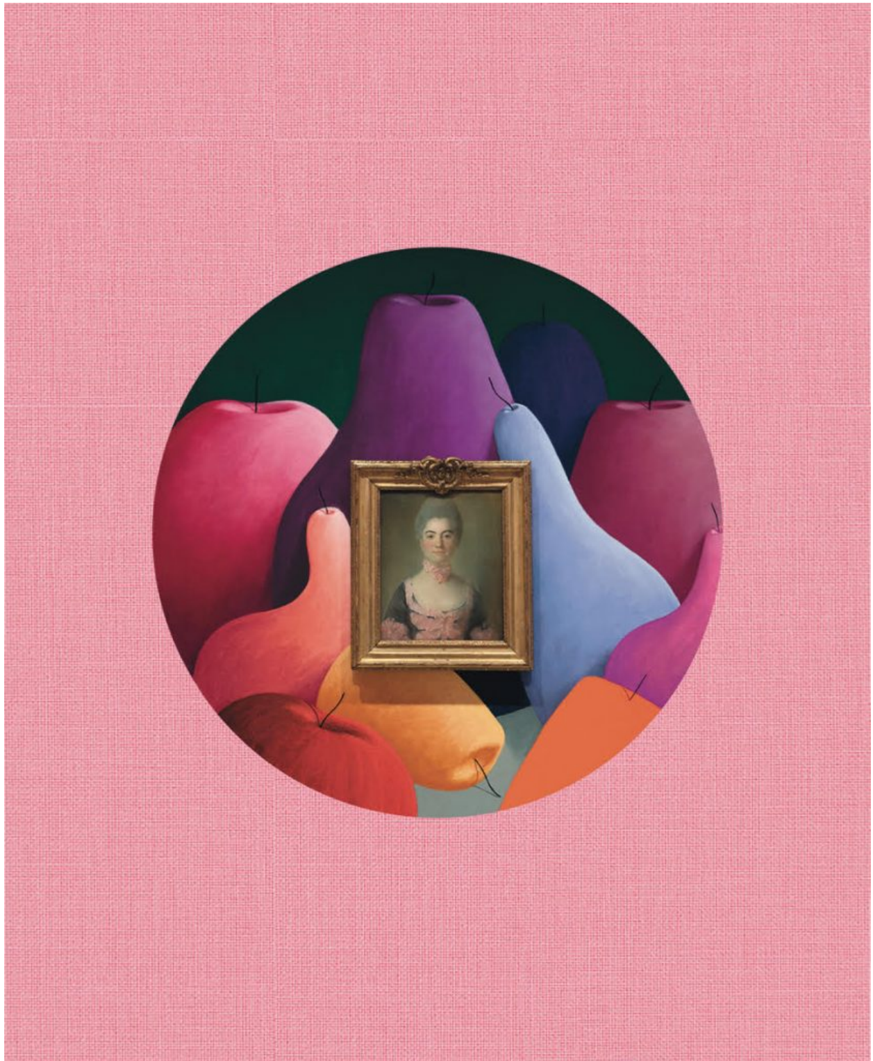
Cover of Nicolas Party: Pastel, published by The FLAG Art Foundation, Designed by Karma