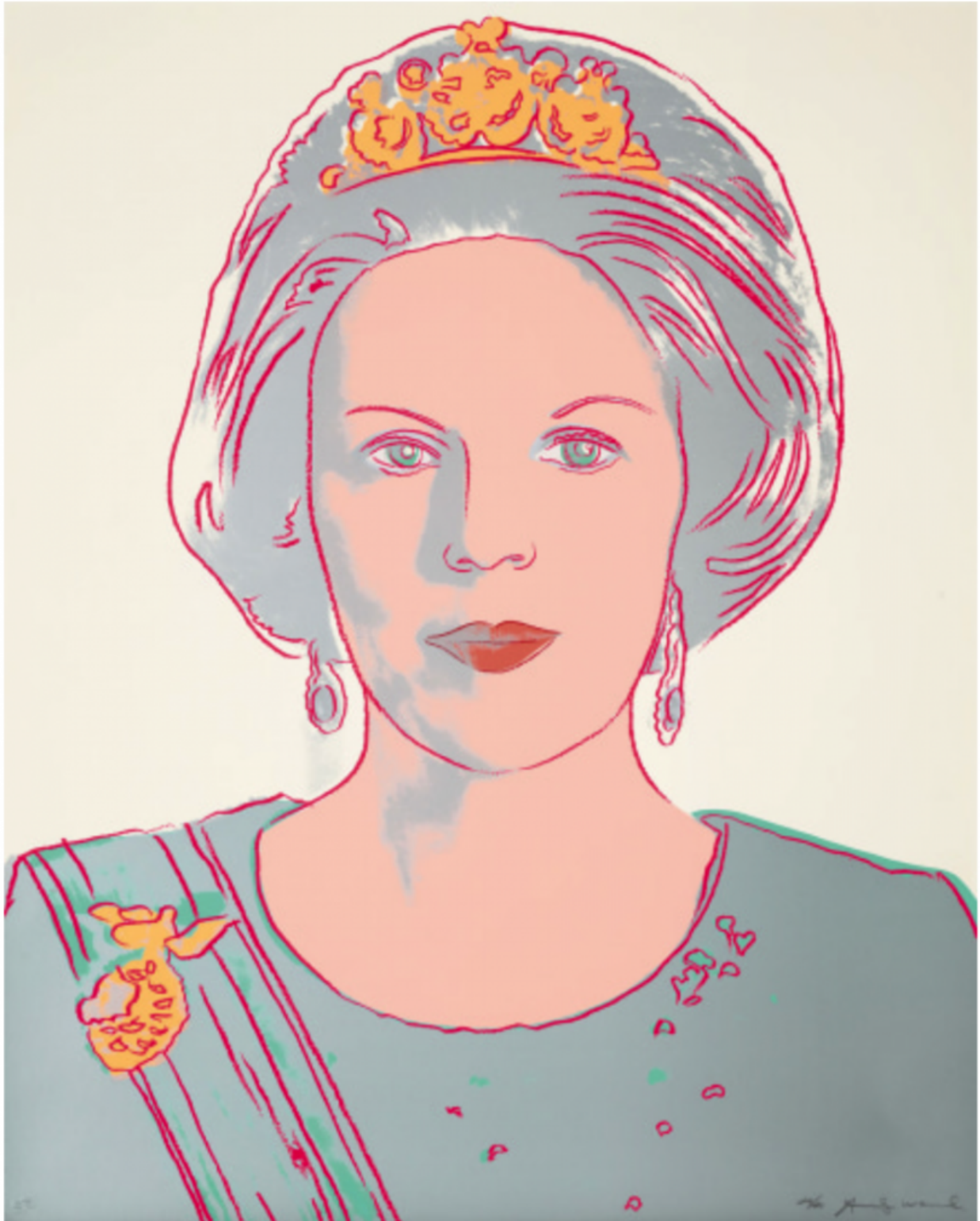
Andy Warhol, Queen Beatrix of the Netherlands (1985) from the series “Reigning Queens.”