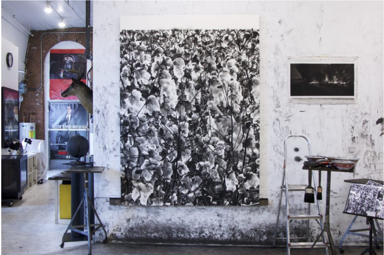
Robert Longo, Untitled (Field of Cotton, Alabama) (2019). Courtesy of the artist; Metro Pictures, New York; and Pace Gallery.