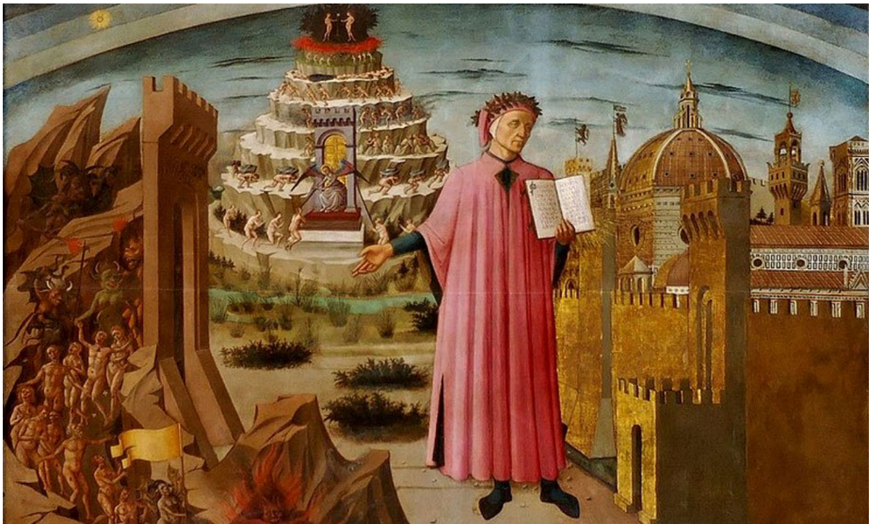
Domenico di Michelino, La Divina Commedia di Dante (Dante and His Poem) (1465). Collection of the Santa Maria del Fiore, Florence.