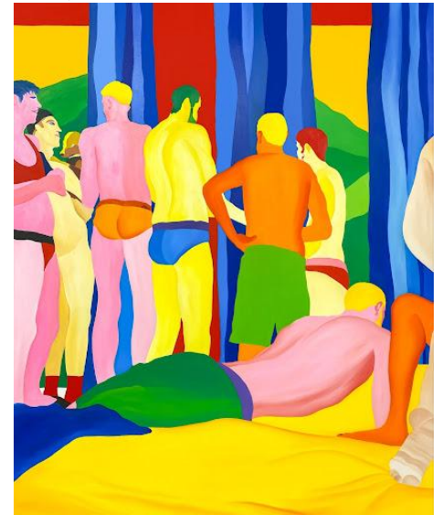
Wedding, 2022 oil on canvas, 67h x 55w inches