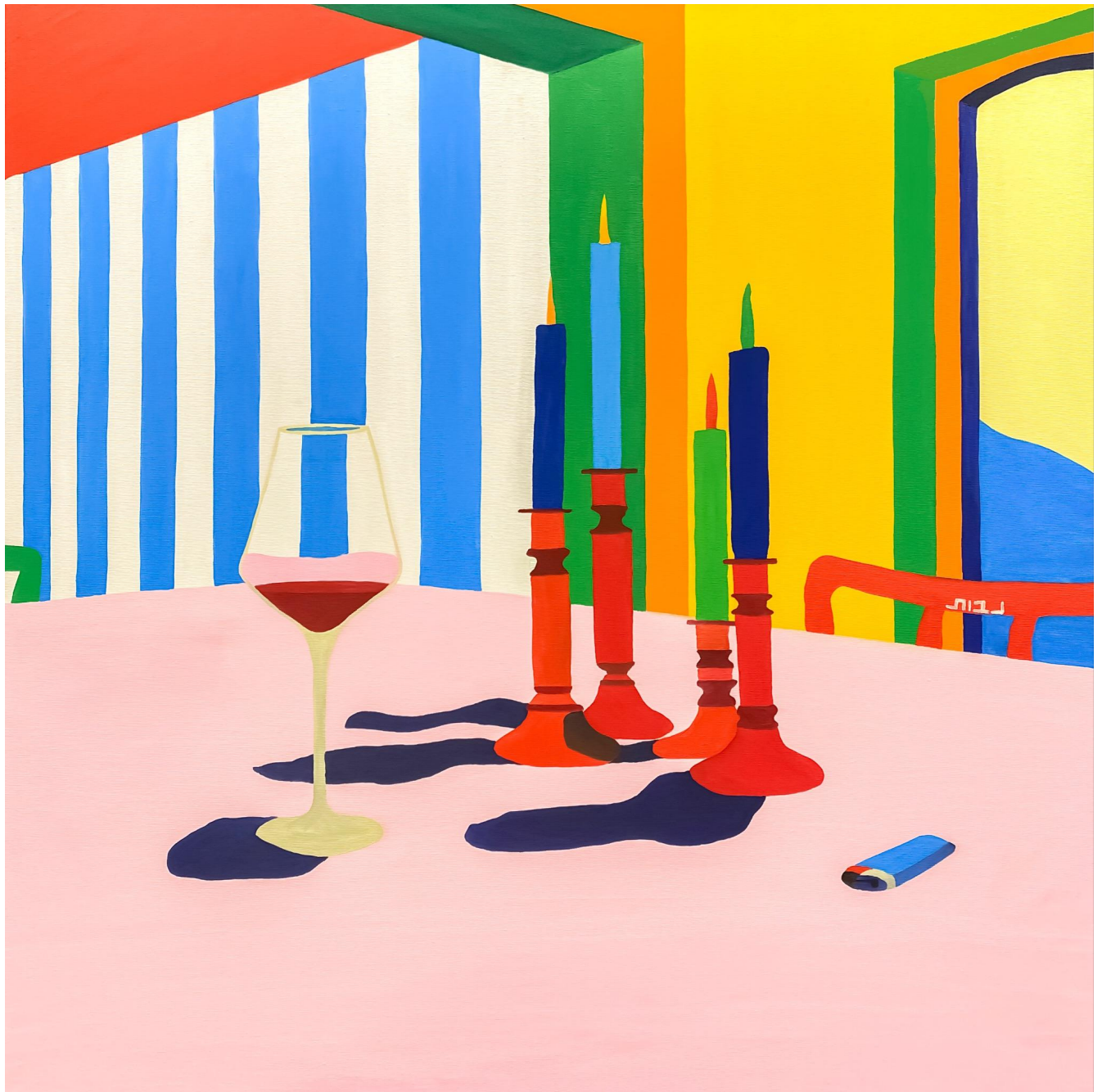
Navot Miller Shabbes candles, 2022 oil on canvas 40h x 40w inches