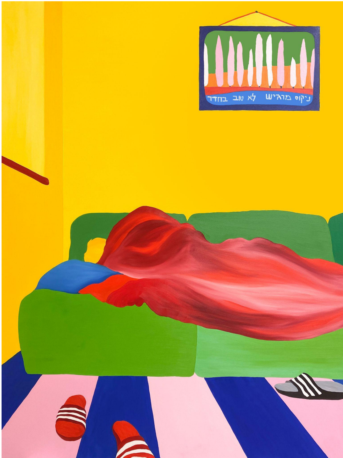
Navot Miller Nikos , 2022 oil on canvas 63h x 48w inches