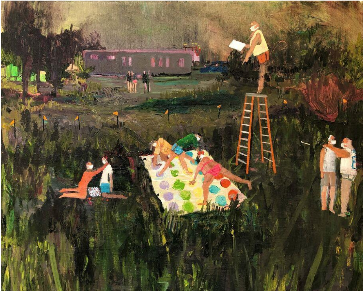
Grace Metzler Covid Twister , 2020 Taymour Grahne Projects Sold

becomes a perfectly crisp white pair of socks or a background figure seen through a window who is unexplainably holding up a string telephone to its ear.