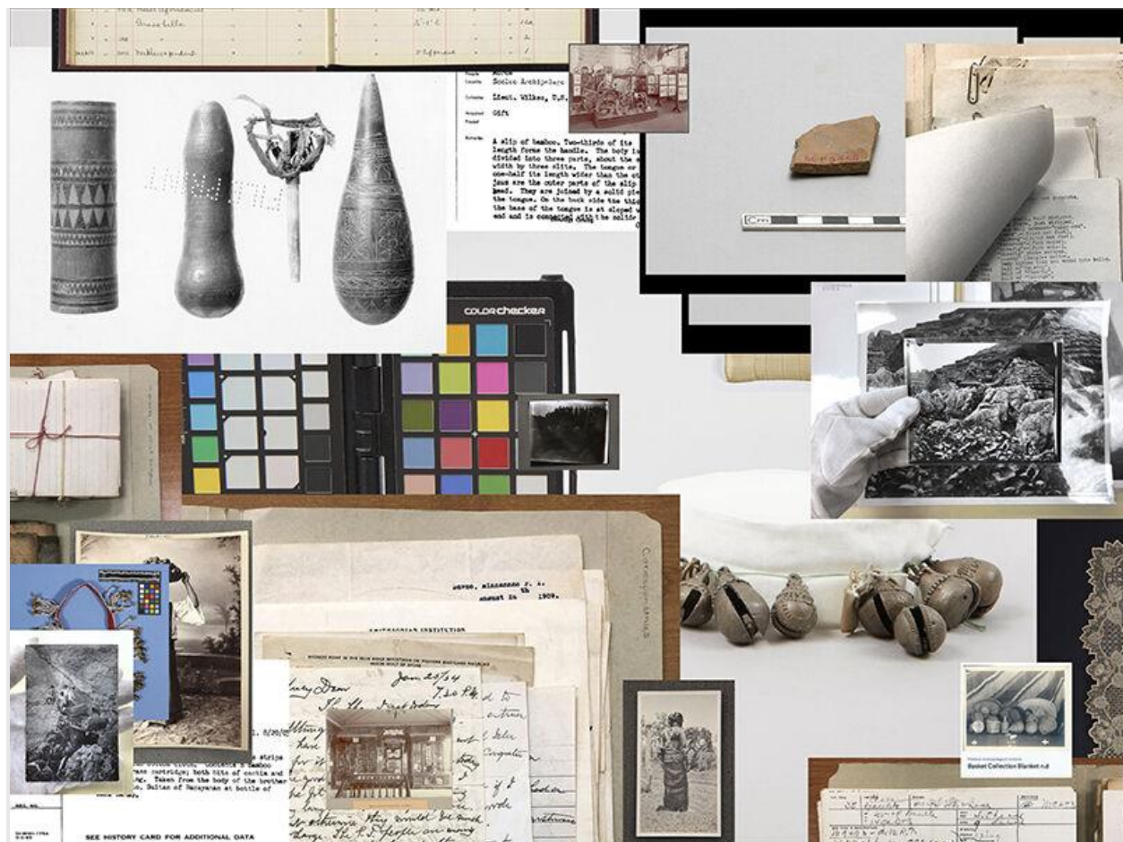
Stephanie Syjuco Pileup (Brass Bells) , 2021 Catharine Clark Gallery US$26,000

This April, Stephanie Syjuco 's activist-driven practice is showcased in two major exhibitions. At the Baltimore Museum of Art, her three-part installation Vanishing Point (Overlay) brings symbols of white supremacy into focus. The exhibition includes a presentation of fictional flags from film and television that depict non-Western countries as terrorist, backwards, and unstable, as well as a display of 19th-century works from the museum's own collection that the artist