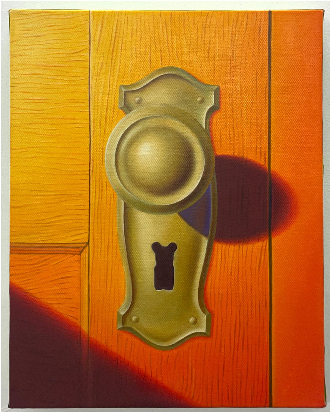
Landon Bailey Higgins Golden Knob , 2023 oil on linen 14h x 11w inches