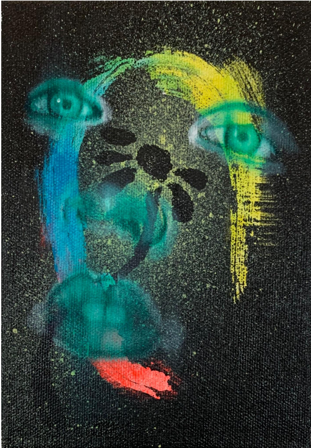
Alyssa Klauer Flower Alchemy, 2022 acrylic and oil on canvas 7h x 5w inches