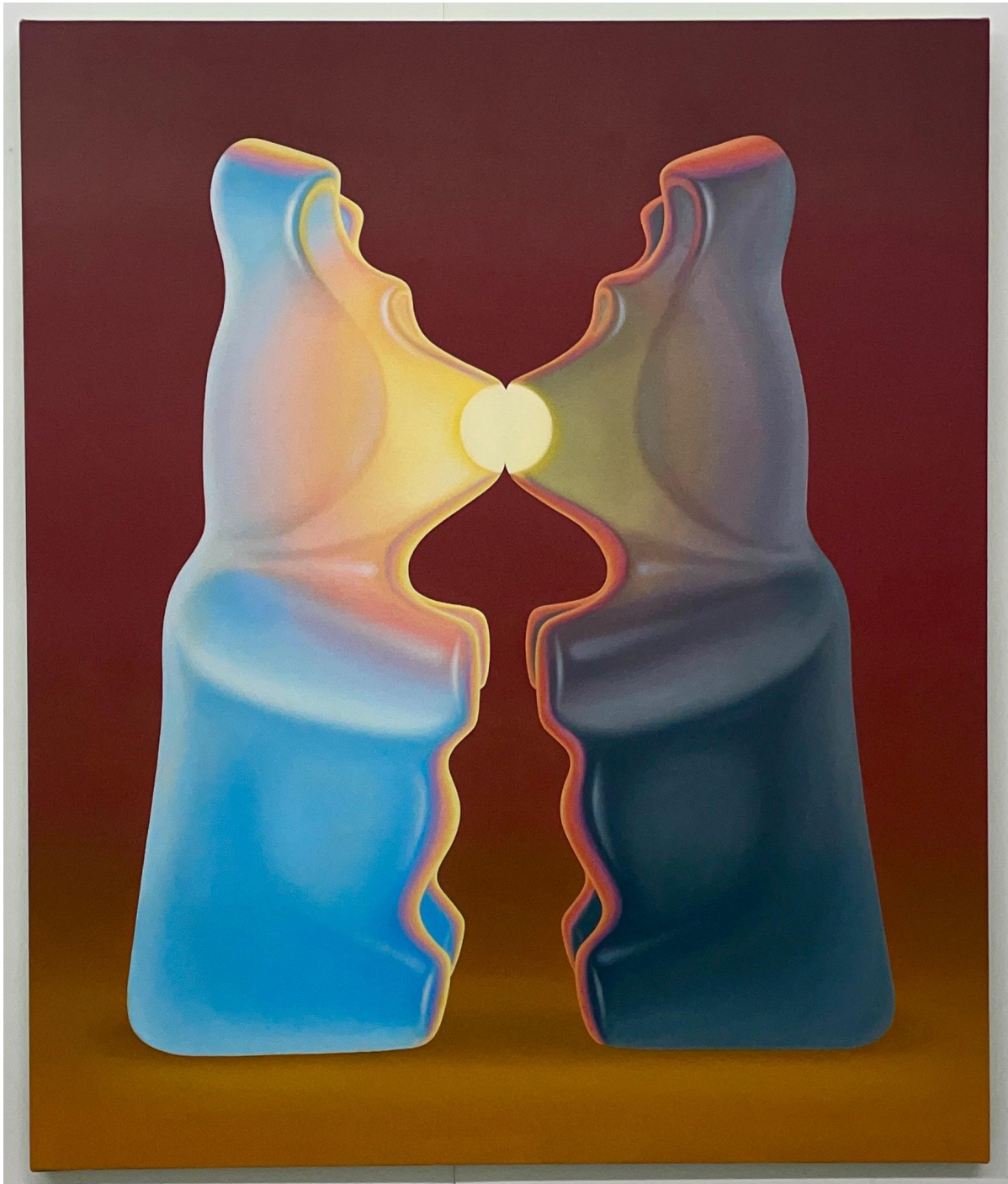
Landon Bailey Higgins Sun and Moon, 2023 oil on canvas 50h x 42w inches