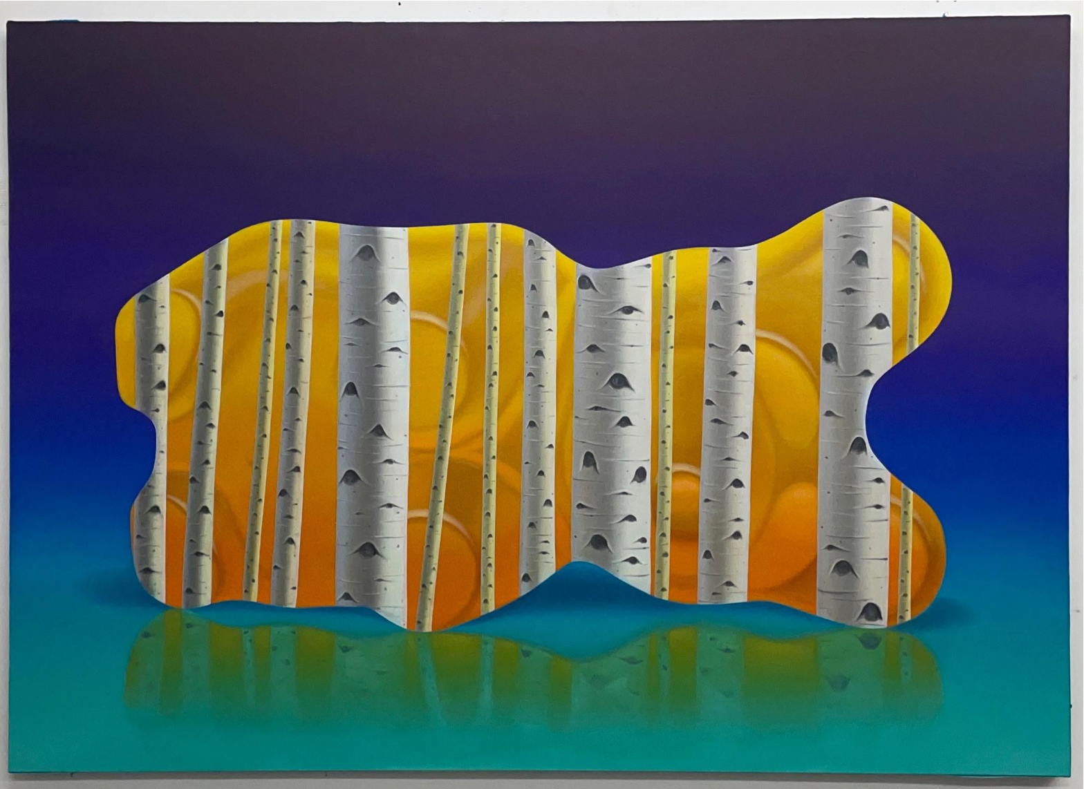
Landon Bailey Higgins Quiet Reflection, 2023 oil on linen 52h x 73w inches