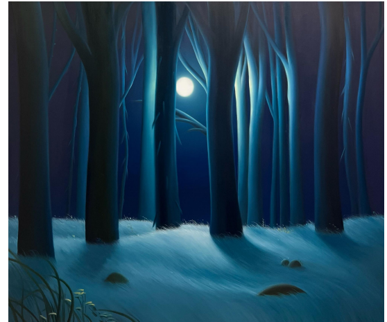
Sarah Lee, Night breeze , 2023, oil on canvas, 60h x 70w inches

Eternal Reverie refers to a period of endless daydreaming; of a desire to exist within a fantasyland, only accessible through another plane of thought. Walking the line between abstraction and realism, these artists are all penetrating new terrain with the creation of uncanny scenes.