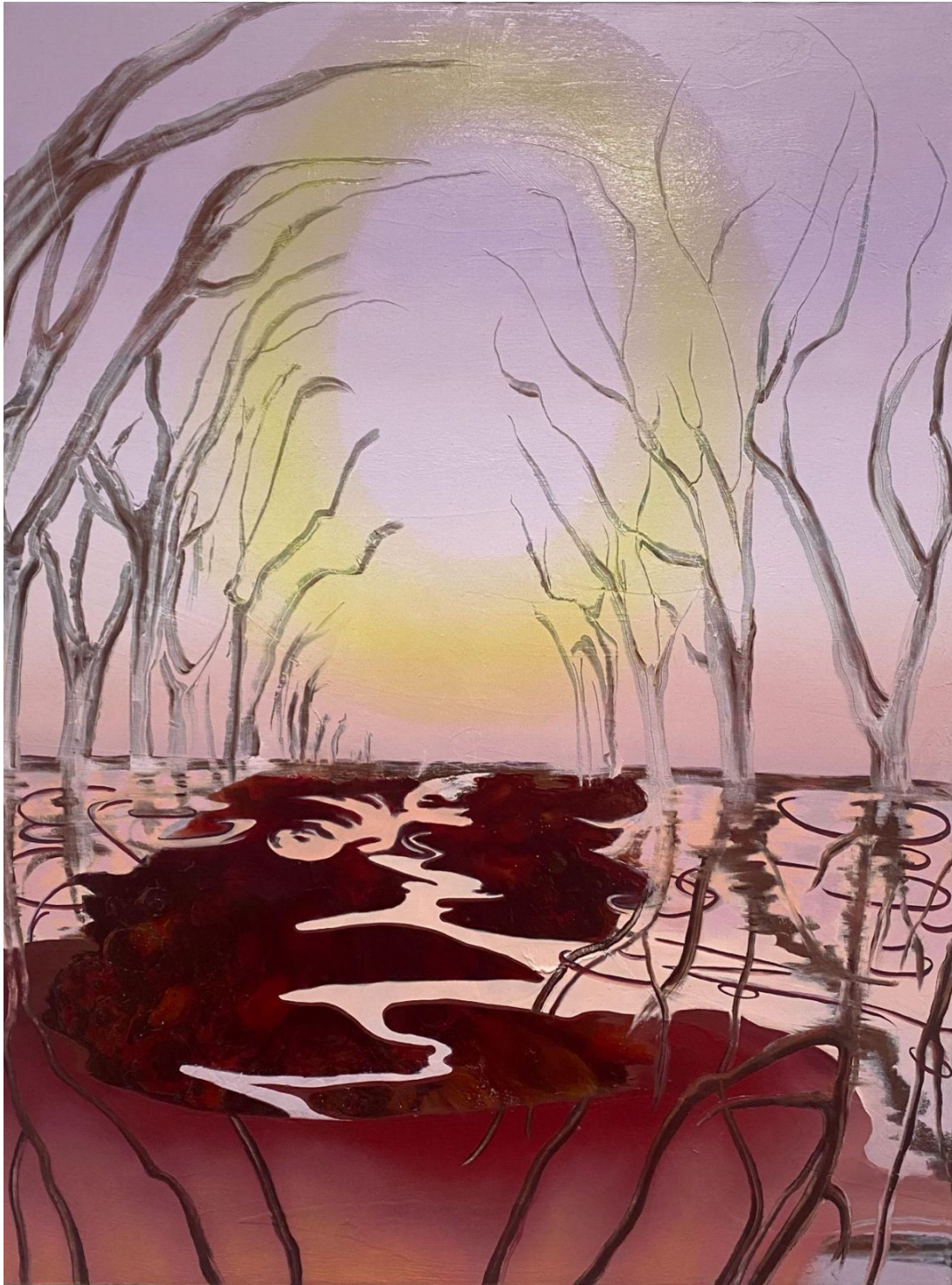
Olive Diamond Red Lake, 2022 oil on canvas 40h x 30w inches