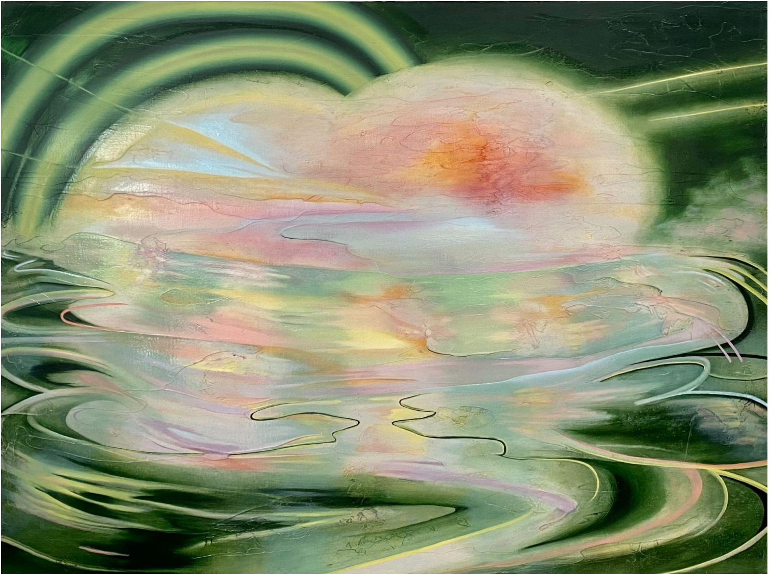
Olive Diamond Belt of Venus, 2022 oil on linen 36h x 48w inches