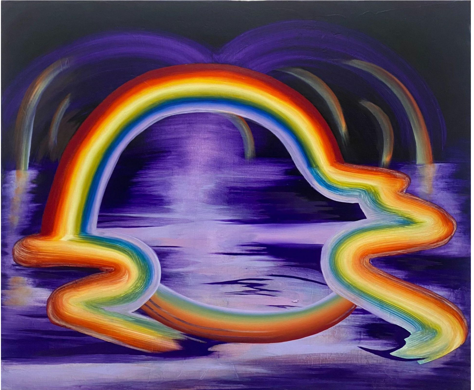
Olive Diamond Lunar Cataclysm, 2022 oil on canvas 20h x 24w inches