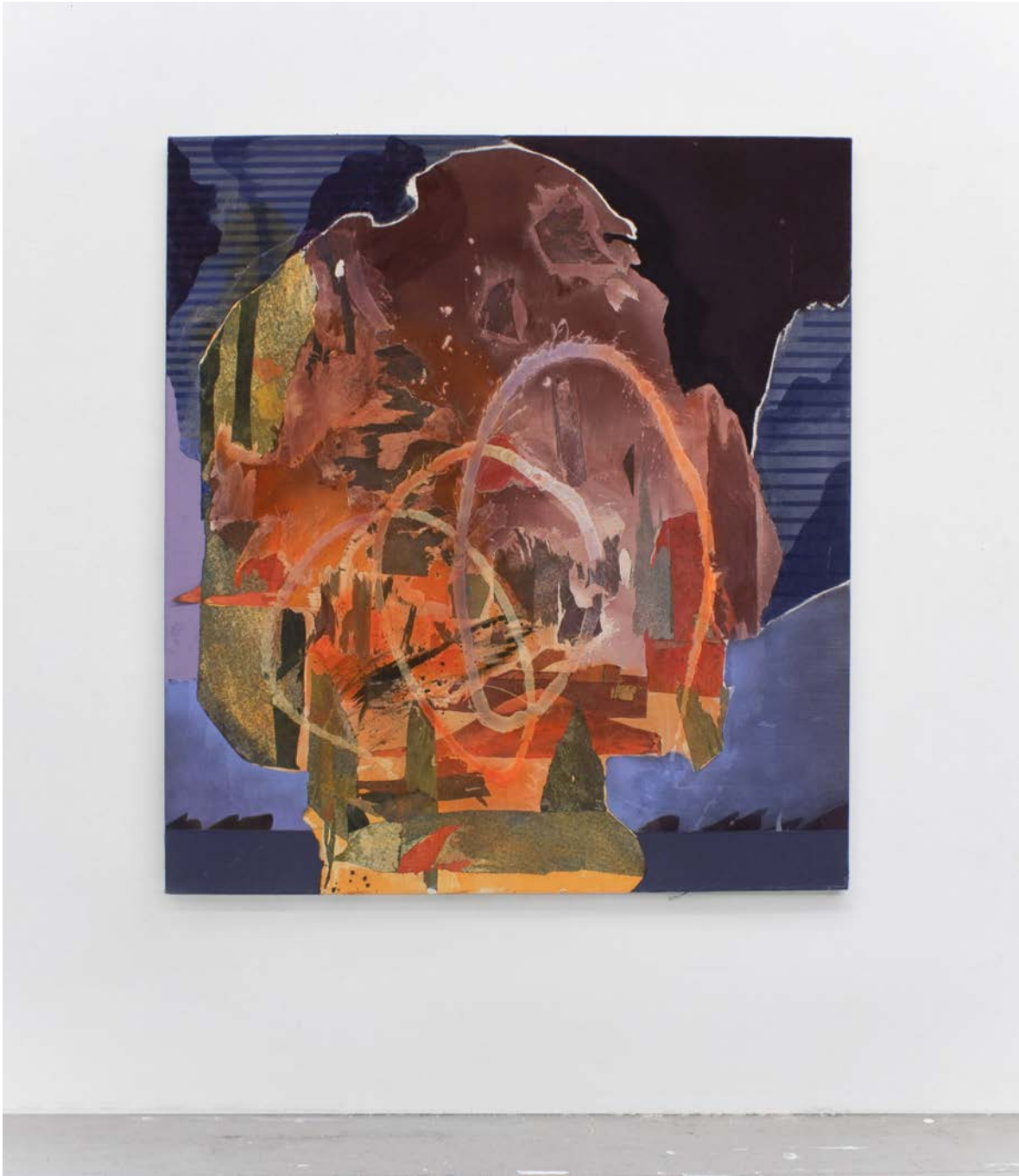
Madeline Peckenpaugh Heat Retention, 2020 Oil, acrylic, paper on canvas 60h x 56w inches