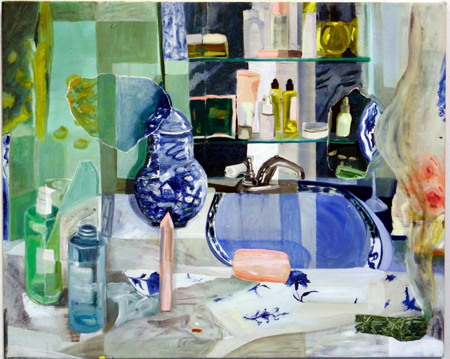
Kiernan Pazdar CBD Crystal Card House, 2020 Oil on linen 32h x 40w inches