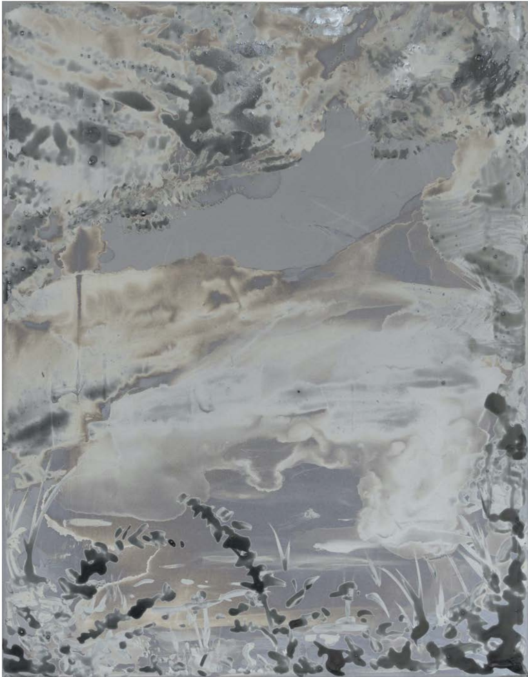
Kara Cox Reflective Scape , 2019 Acrylic on reflective fabric 14h x 11w inches