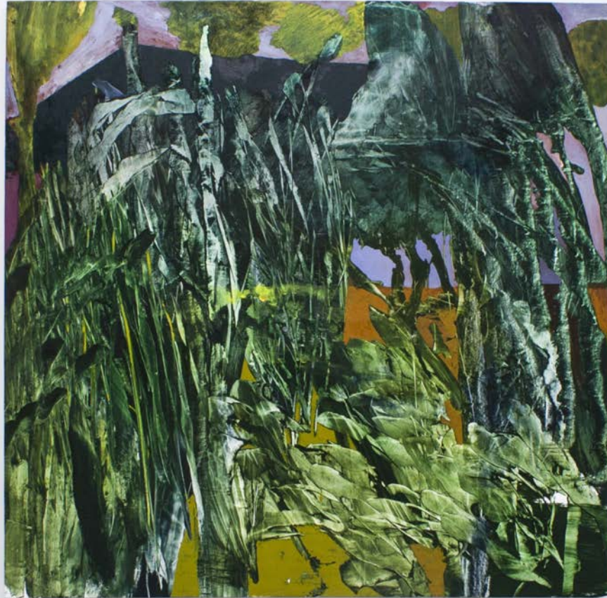
Madeline Peckenpaugh Flowering Dogwood, 2020 Oil on canvas 66h x 66w inches