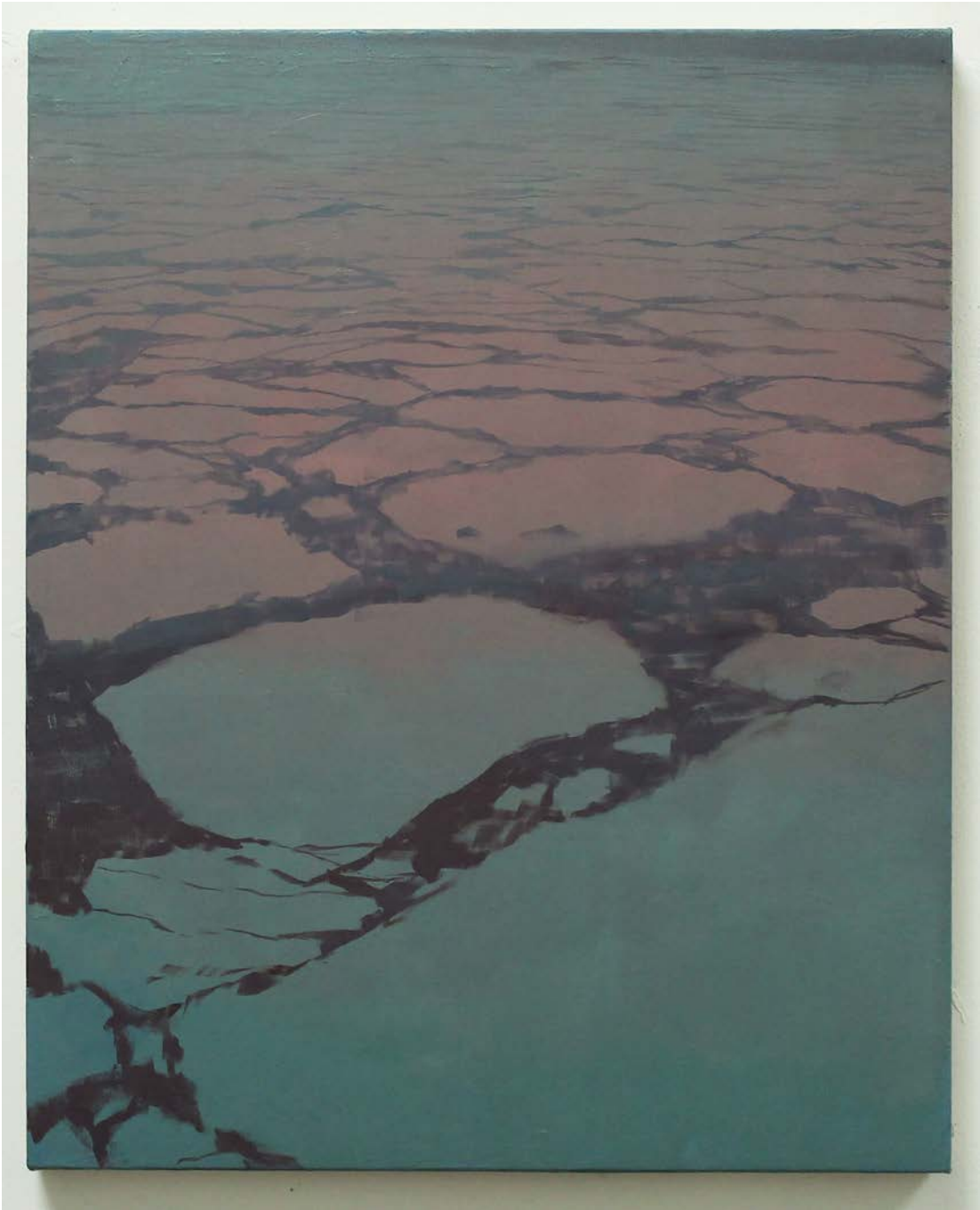
Braden Bandel Ice Sheets , 2019 Oil on canvas 24h x 19.5w inches