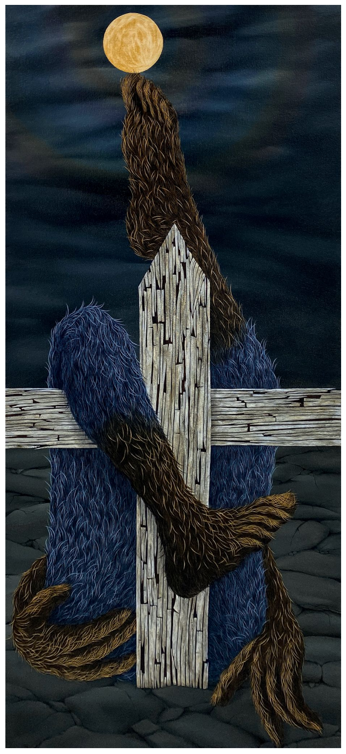
Drew Dodge Night , 2022 oil on canvas 42h x 19w inches