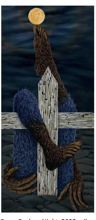
Drew Dodge, Night , 2022, oil on canvas, 42h x 19w inches