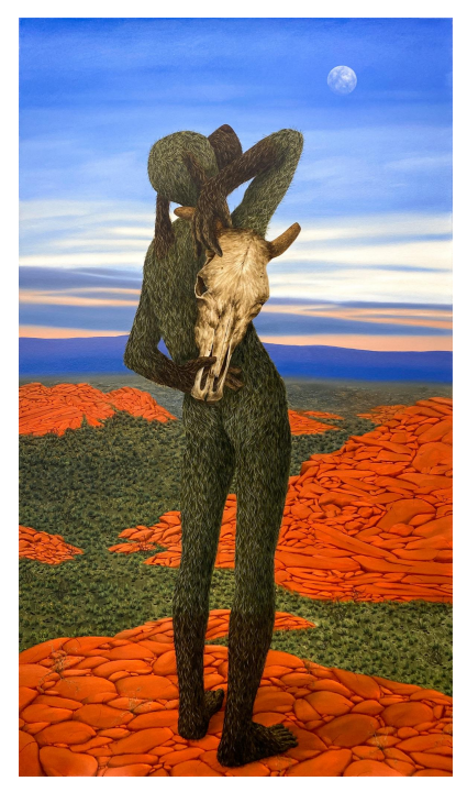
Drew Dodge, Day , 2022, oil on canvas, 84h x 48w inches