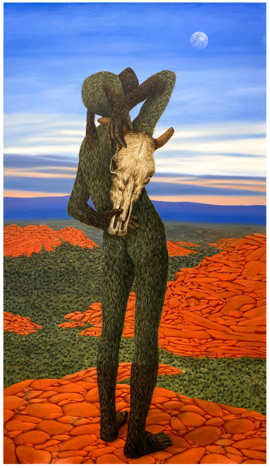
Drew Dodge Day, 2022 oil on canvas 84h x 48w inches