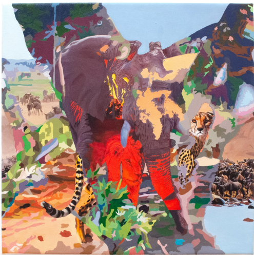
Darryl Westly Interior/Exterior Savannah, 2020 oil on canvas 18h x 18 1/2w inches Private Collection