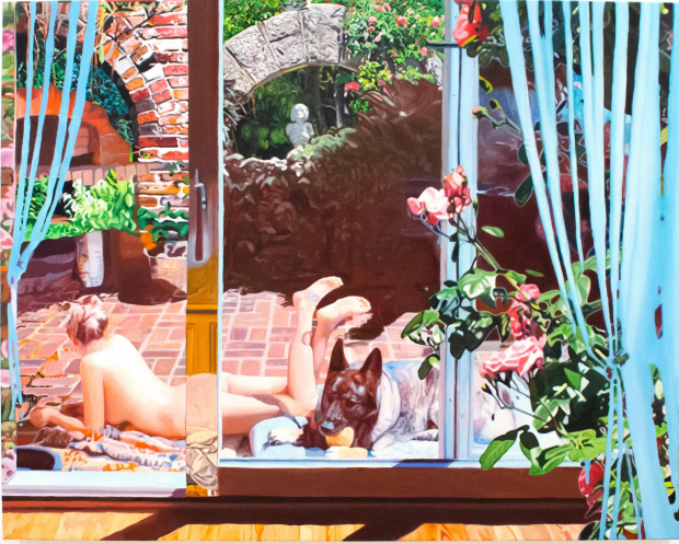
Darryl Westly Interior/Exterior Terrace, 2020 oil on canvas 24h x 30w inches Private Collection