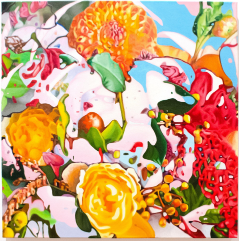
Darryl Westly Interior/Exterior Sunshine (Flowers), 2020 oil on canvas 24h x 24 1/2w inches Private Collection