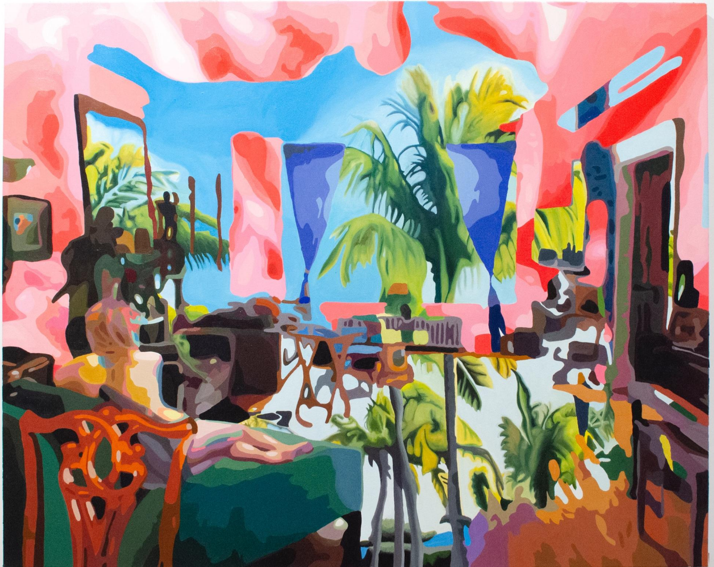
Darryl Westly Gimme Shelter , 2021 oil on canvas 48h x 60w inches