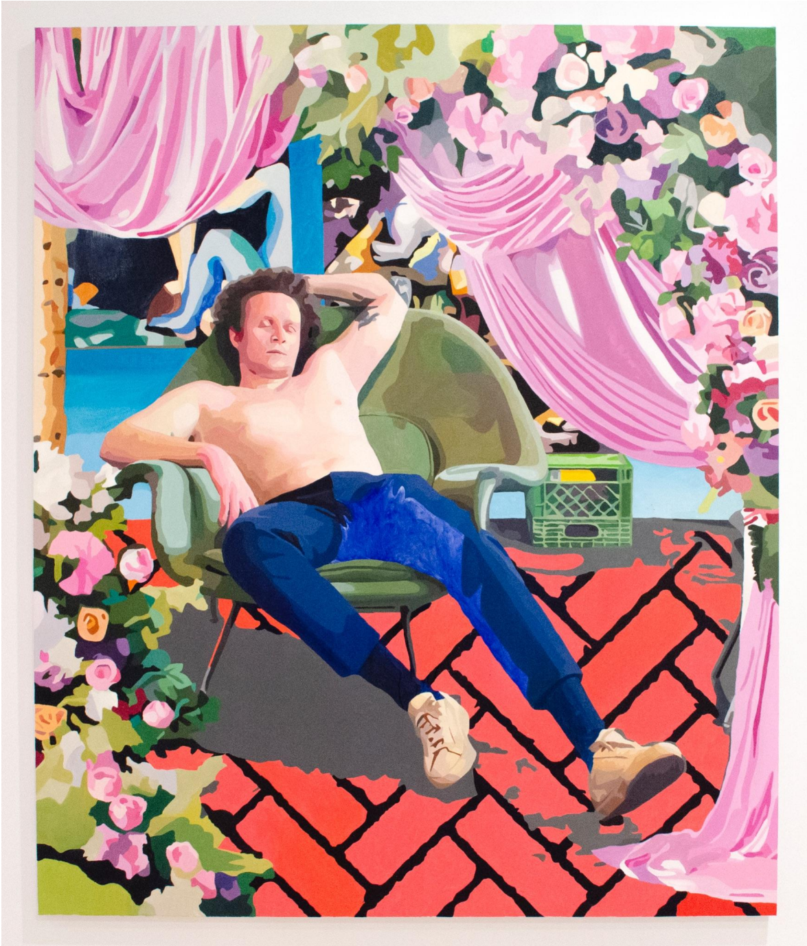
Darryl Westly Tyler , 2021 oil on linen 72h x 60w inches