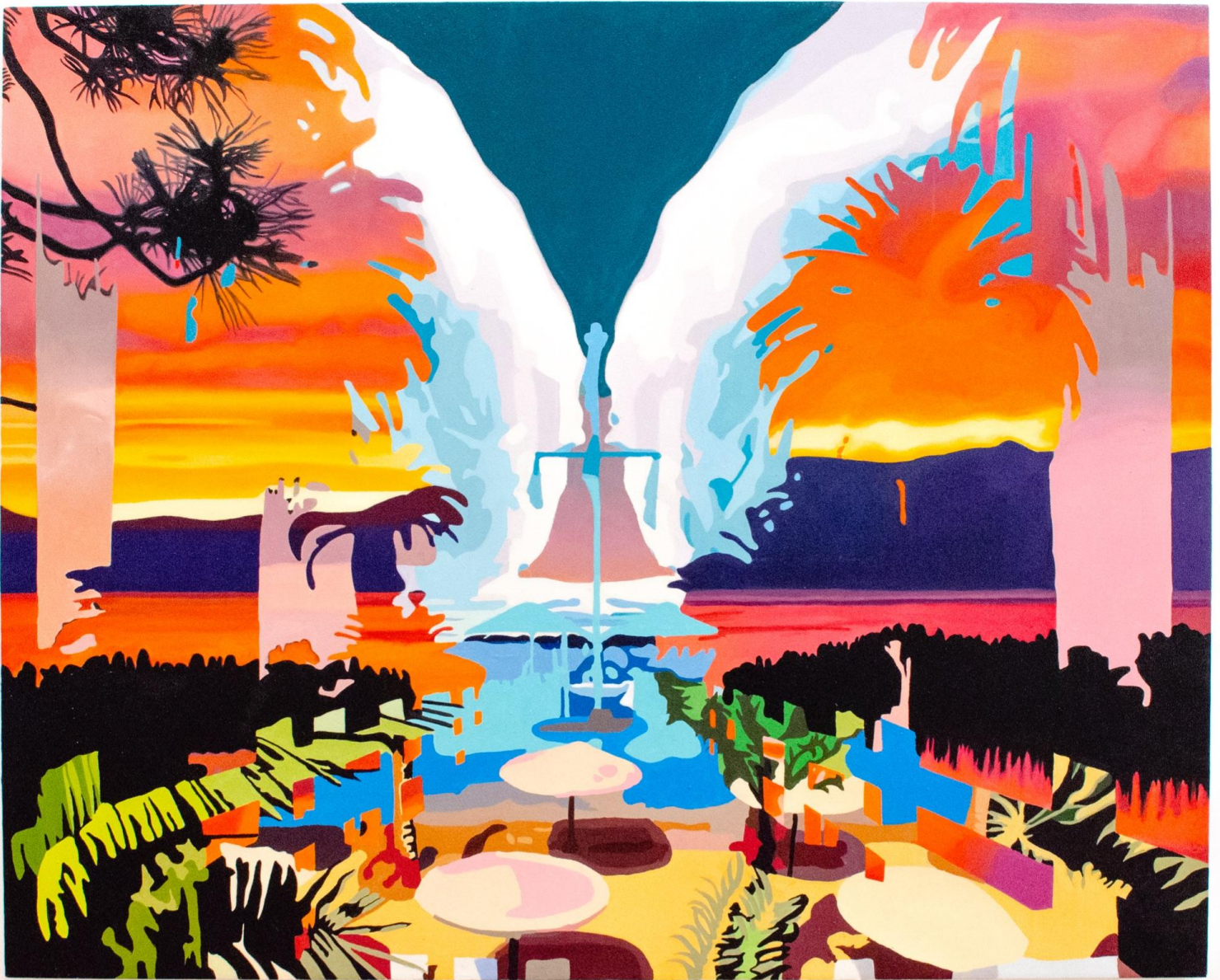
Darryl Westly Tahoe, 2021 oil on canvas 48h x 60w inches