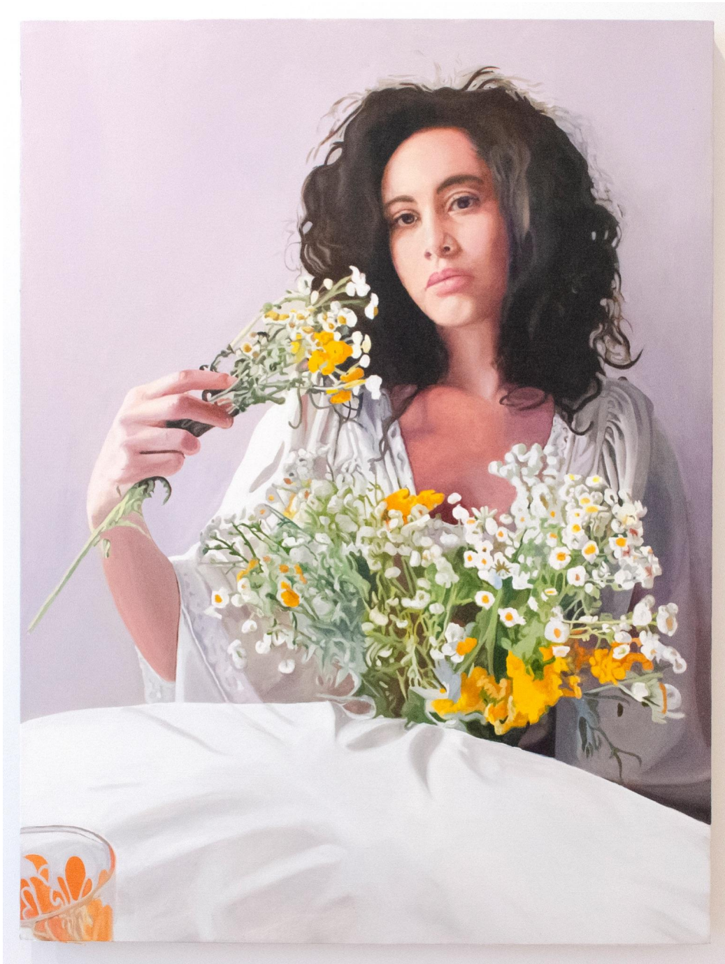
Darryl Westly Woman with Flowers (for Breonna) , 2021 oil on linen 40h x 30w inches