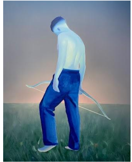
The Other Side Is The Day (Self Portrait In Blue) , 2021, oil, acrylic, and wax on canvas, 60h x 48w inches

Opening: Thursday, November 4 from 11am - 8pm