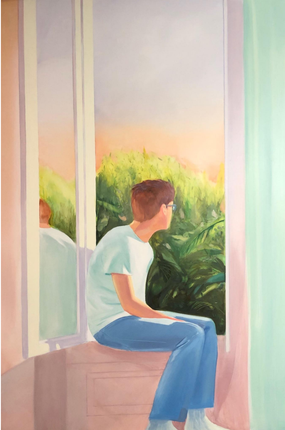
Caleb Hahne After Nothing Comes, 2021 oil and wax on canvas 72h x 48w inches